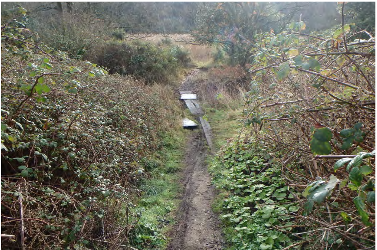
Photograph 18: additional view of section D-E (2)