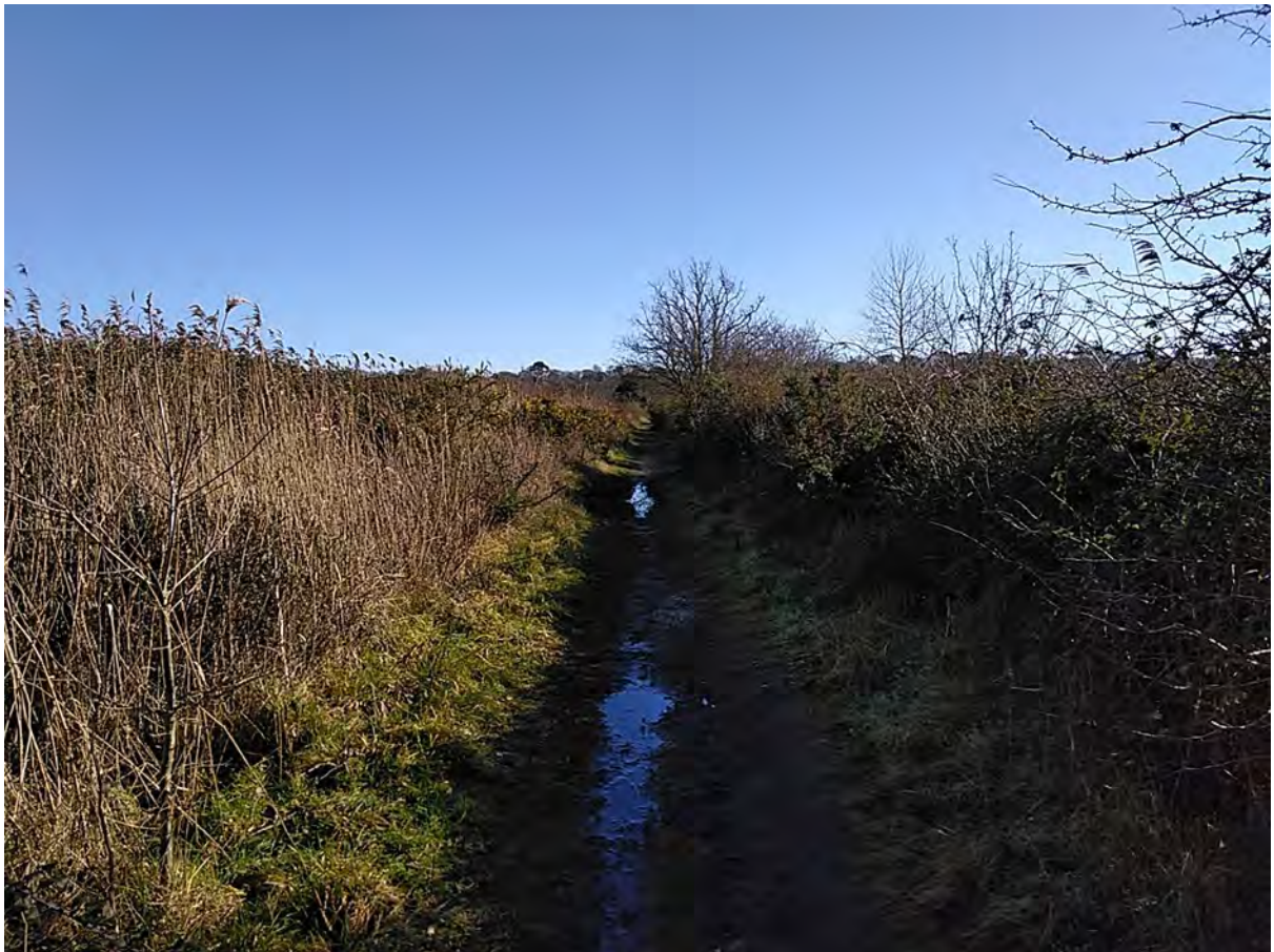
Photograph 4: Section A-B (3)