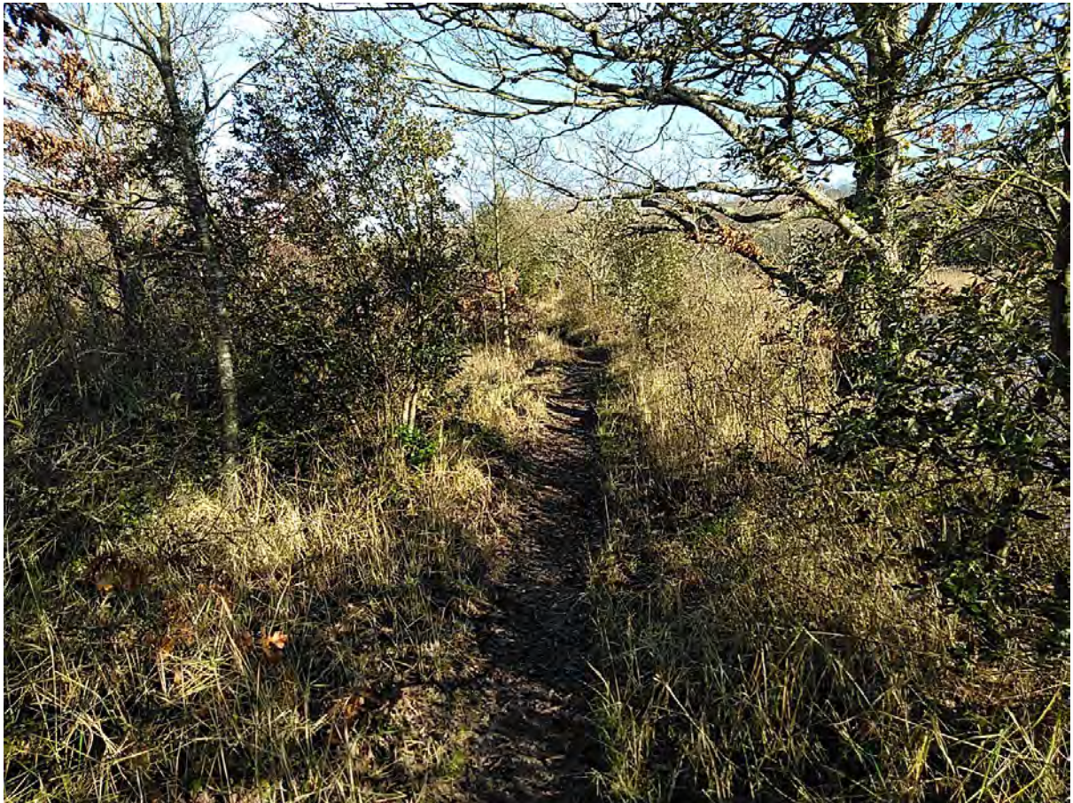
Photograph 7: section of B-D