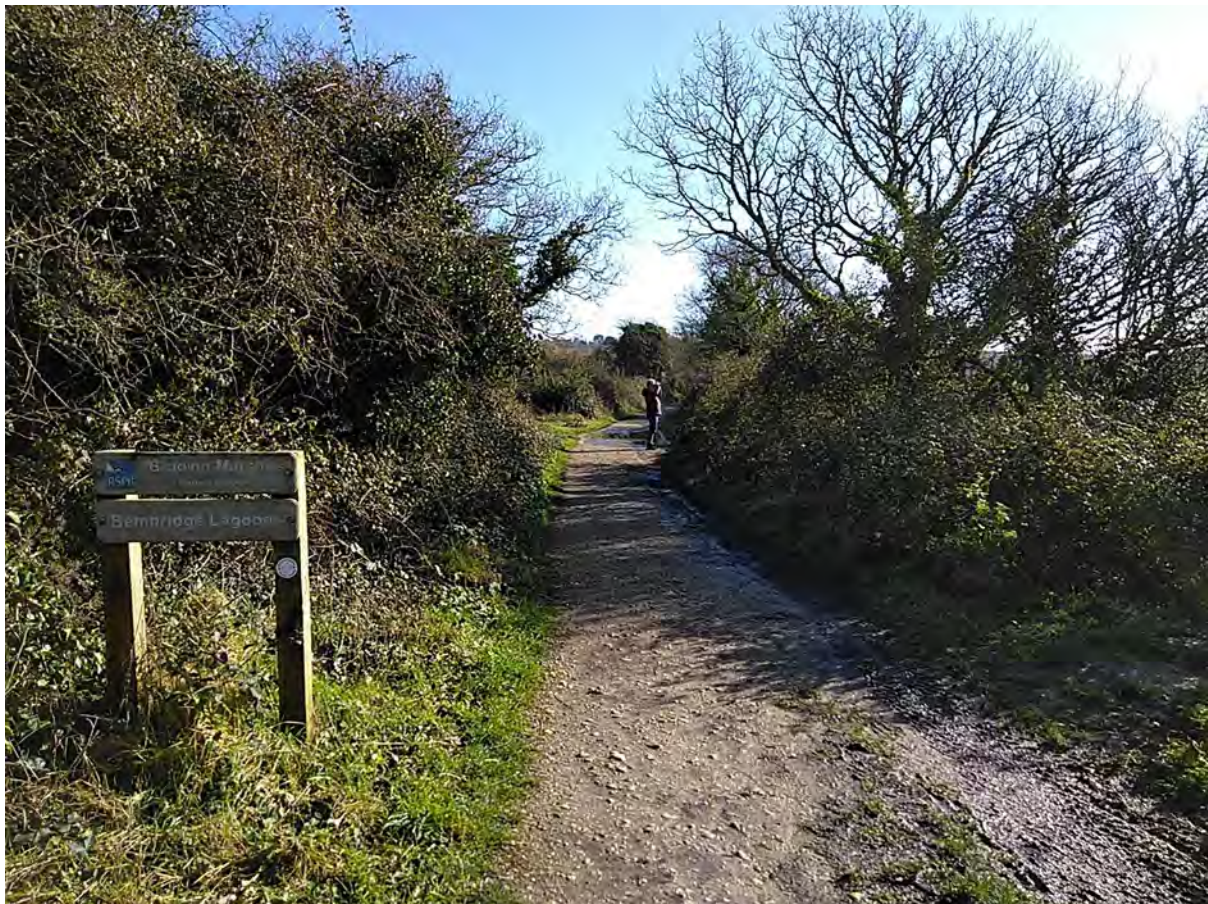
Photograph 2 – Section of A-B (1) start of claimed route after leaving the road