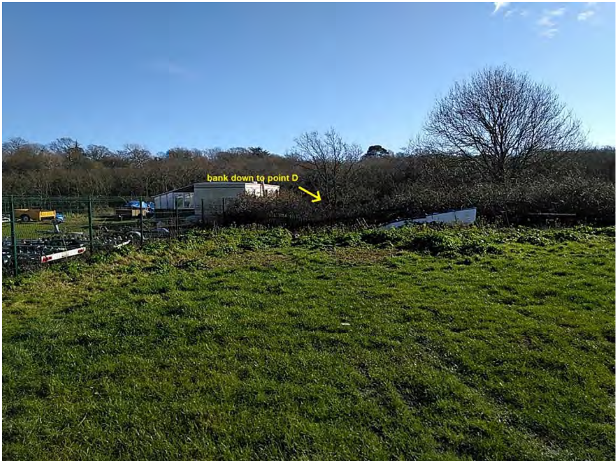
Photograph 11: Section E-D