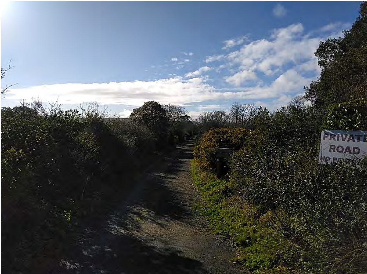
Photograph 13: Section of C-B