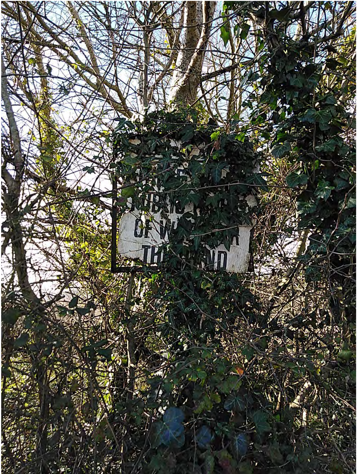
Photograph 16: "no public right of way" sign referred to in photograph 1