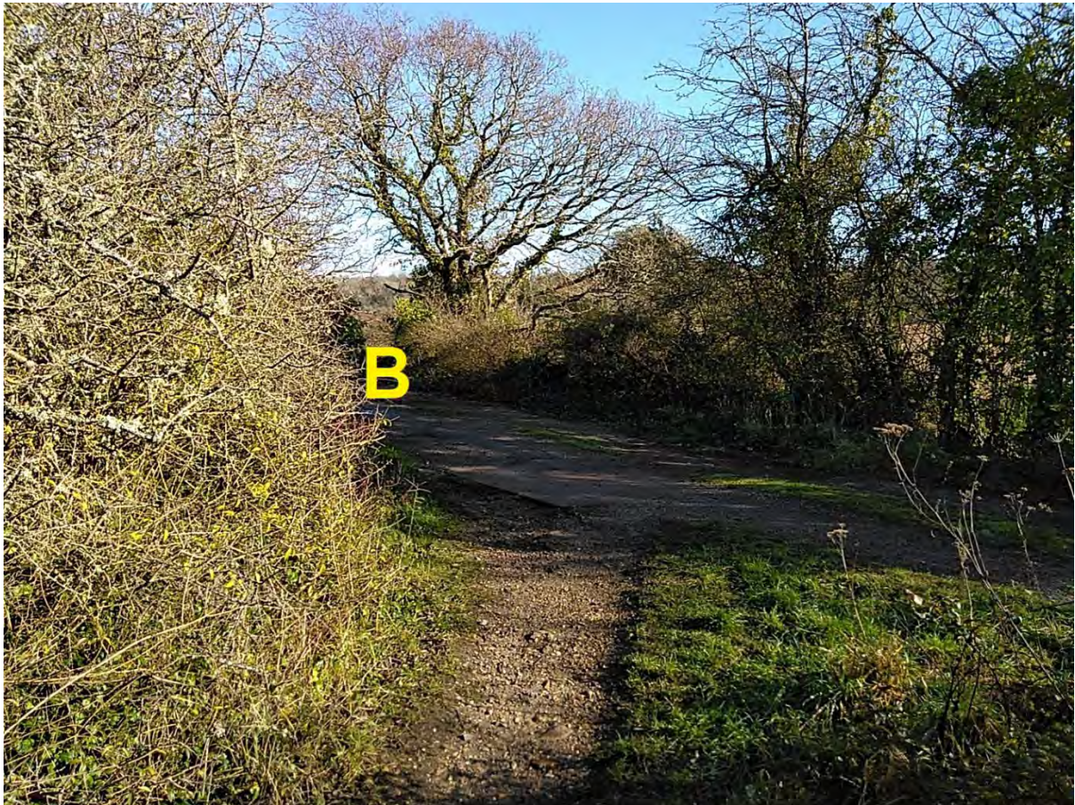
Photograph 5: Point B (at end of section A-B)