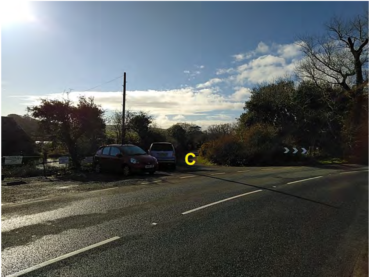
Photograph 12: Point C