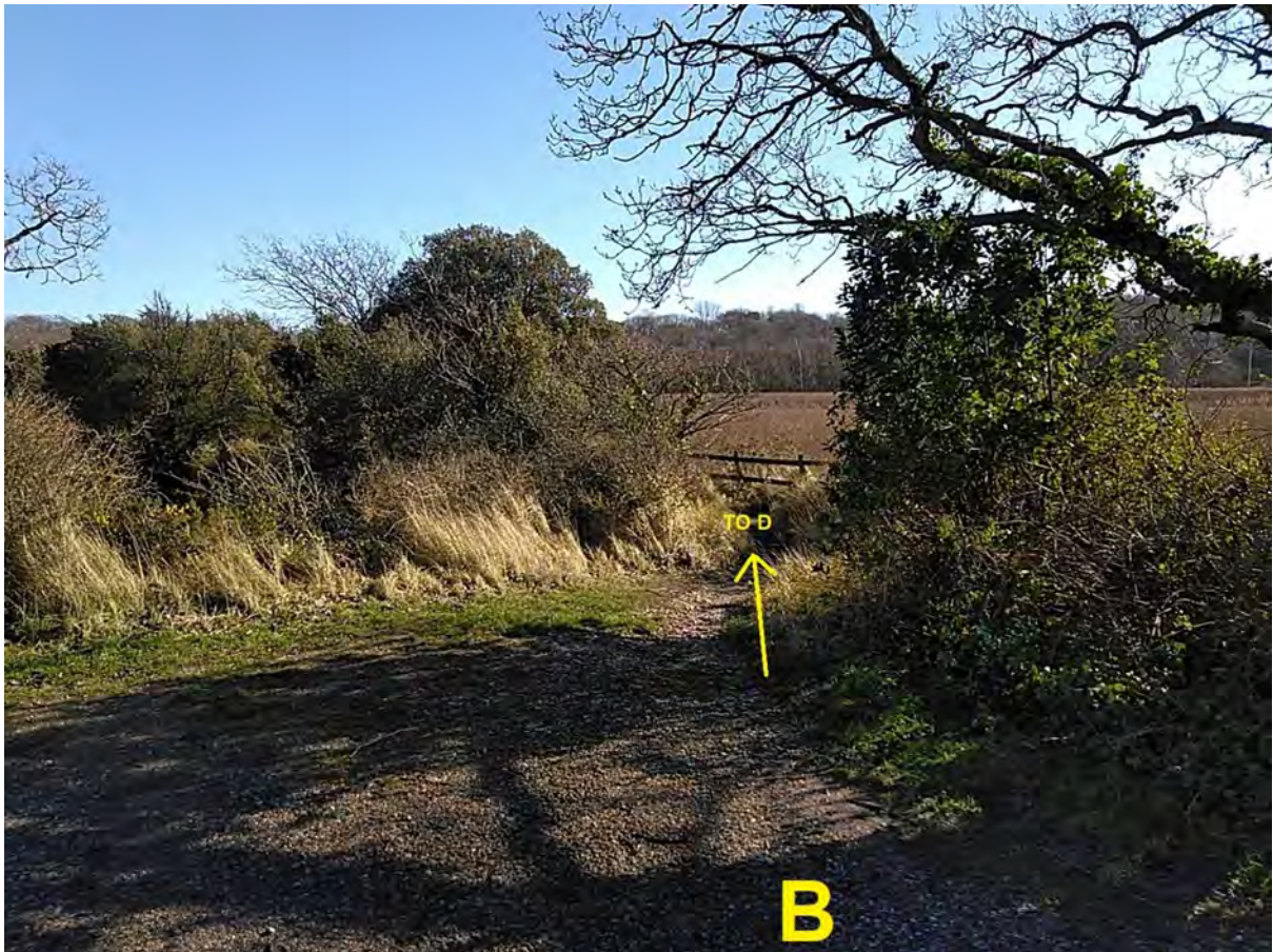
Photograph 6: B to D