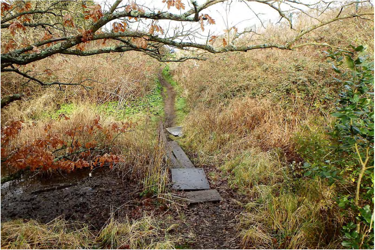
Photograph 17: additional view of section D-E (1)