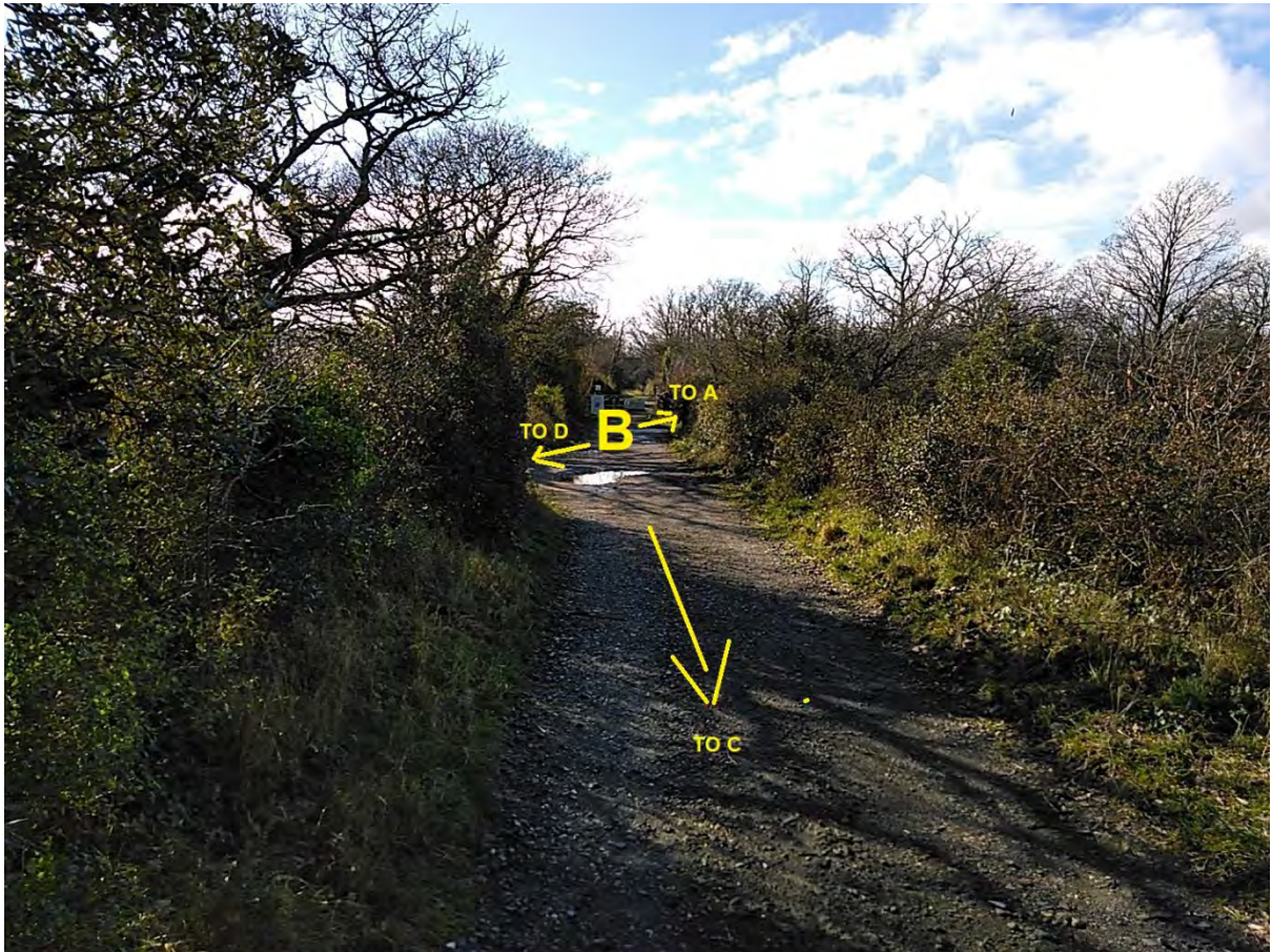
Photograph 14: towards the end of section C-B