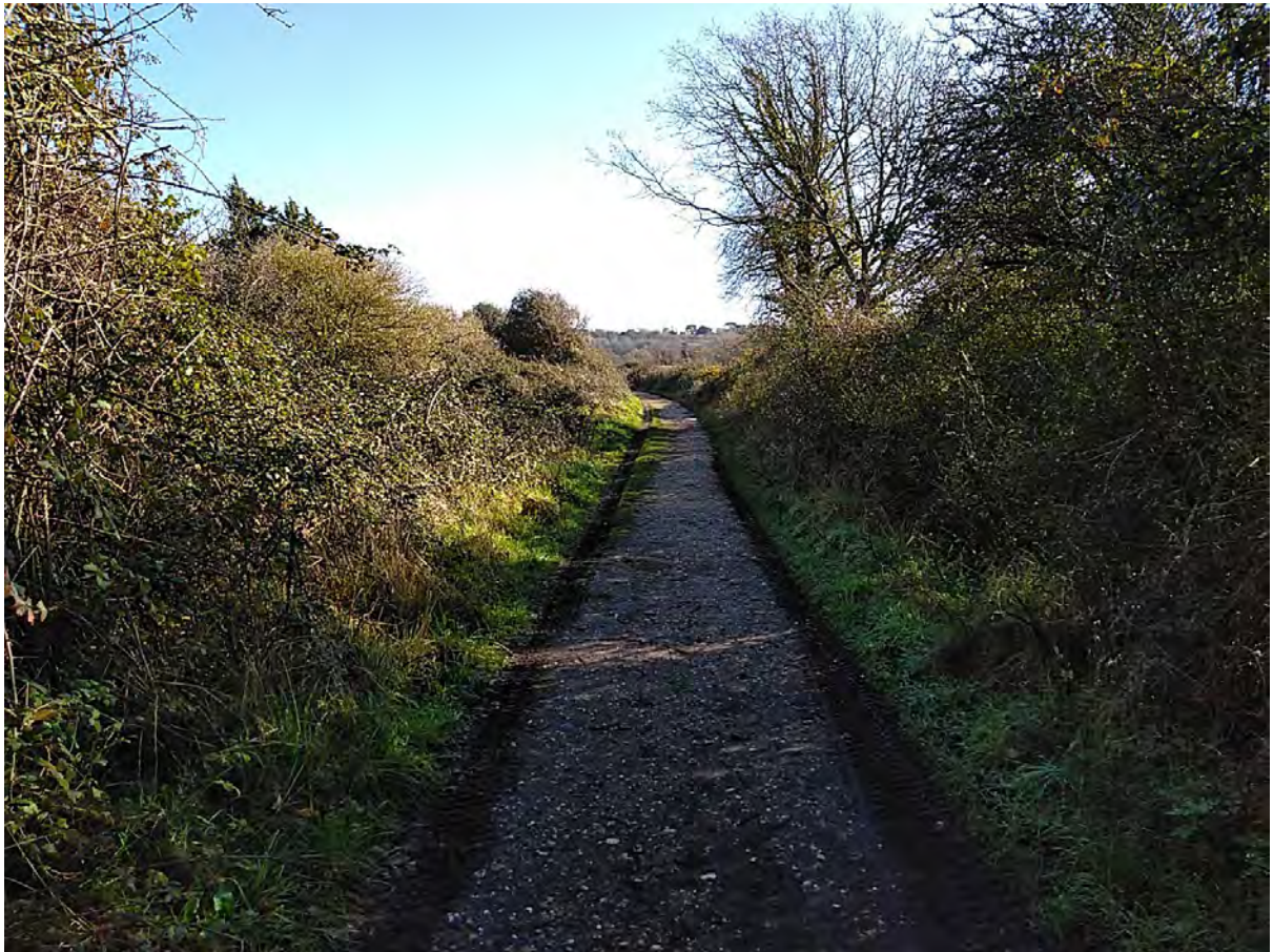
Photograph 3: Section of A-B (2)