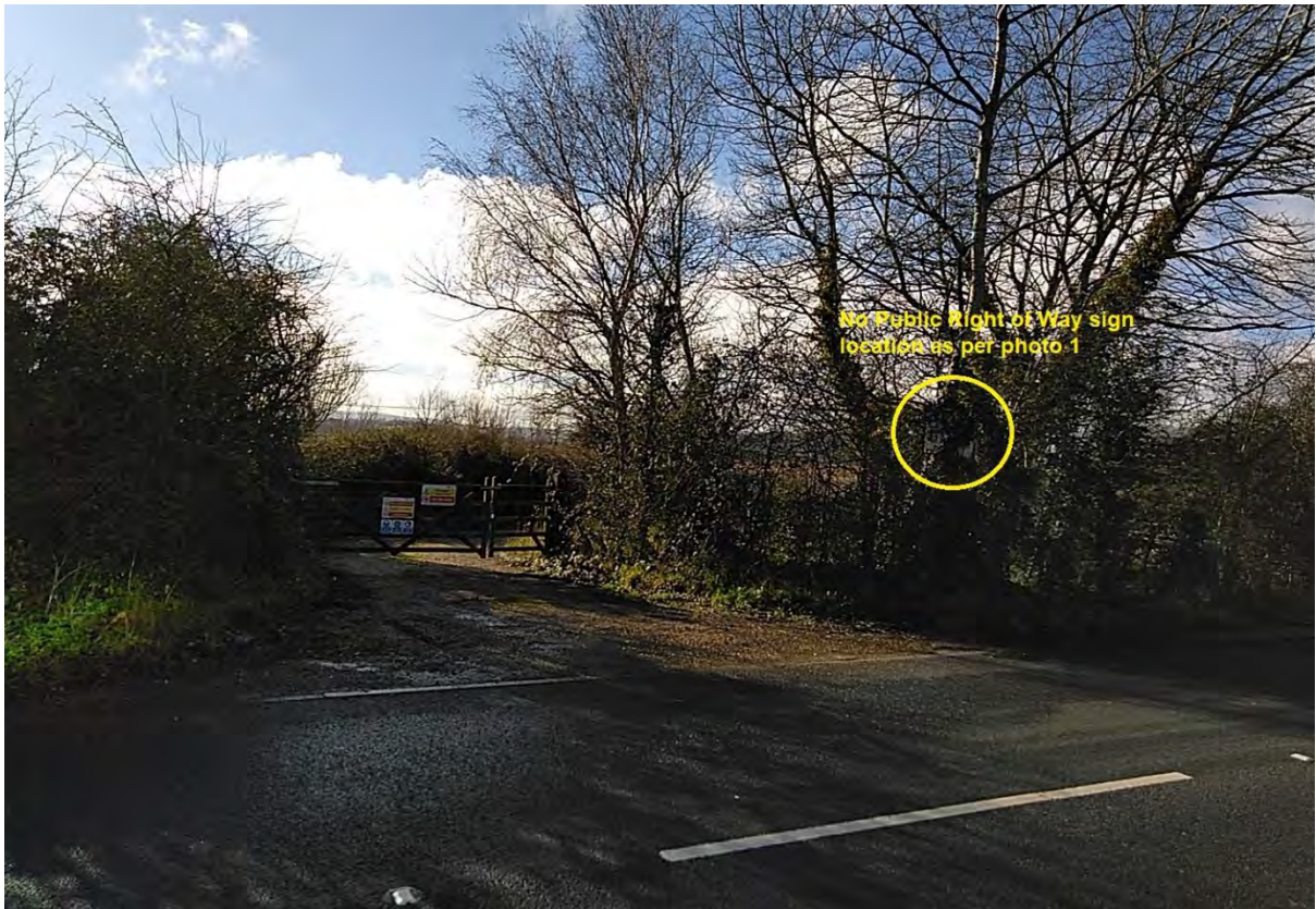
Photograph 15: "no public right of way" sign referred to in photograph 1