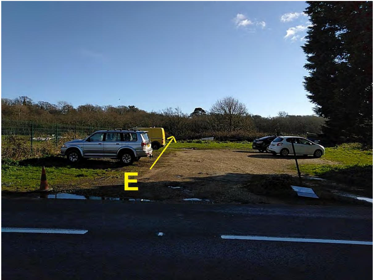
Photograph 10: Point E and direction of claimed route (towards D)