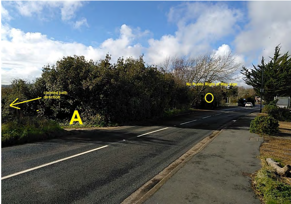
Photograph 1: Point A with "no public right of way" sign in background (see photographs 15 and 16)

(labels/points as per application map; yellow marking up is for indication/explanation purposes only)